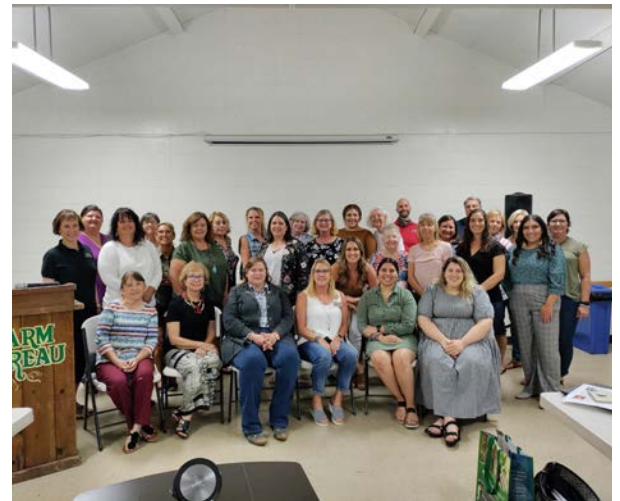
Below: Madera County Farm Bureau meeting hall allowed us to gather together for our Statewide Meeting.