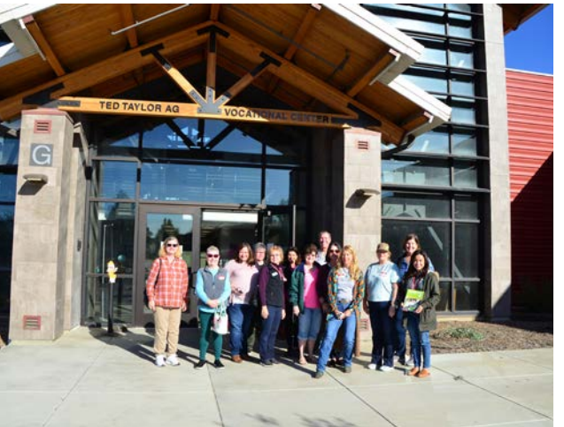
Above photo: Rancho Cielo tour attendees were impressed by the alternative educational facilities for disadvantaged youth. Left: Our CWA members enjoying lunch at Rustique Winery.